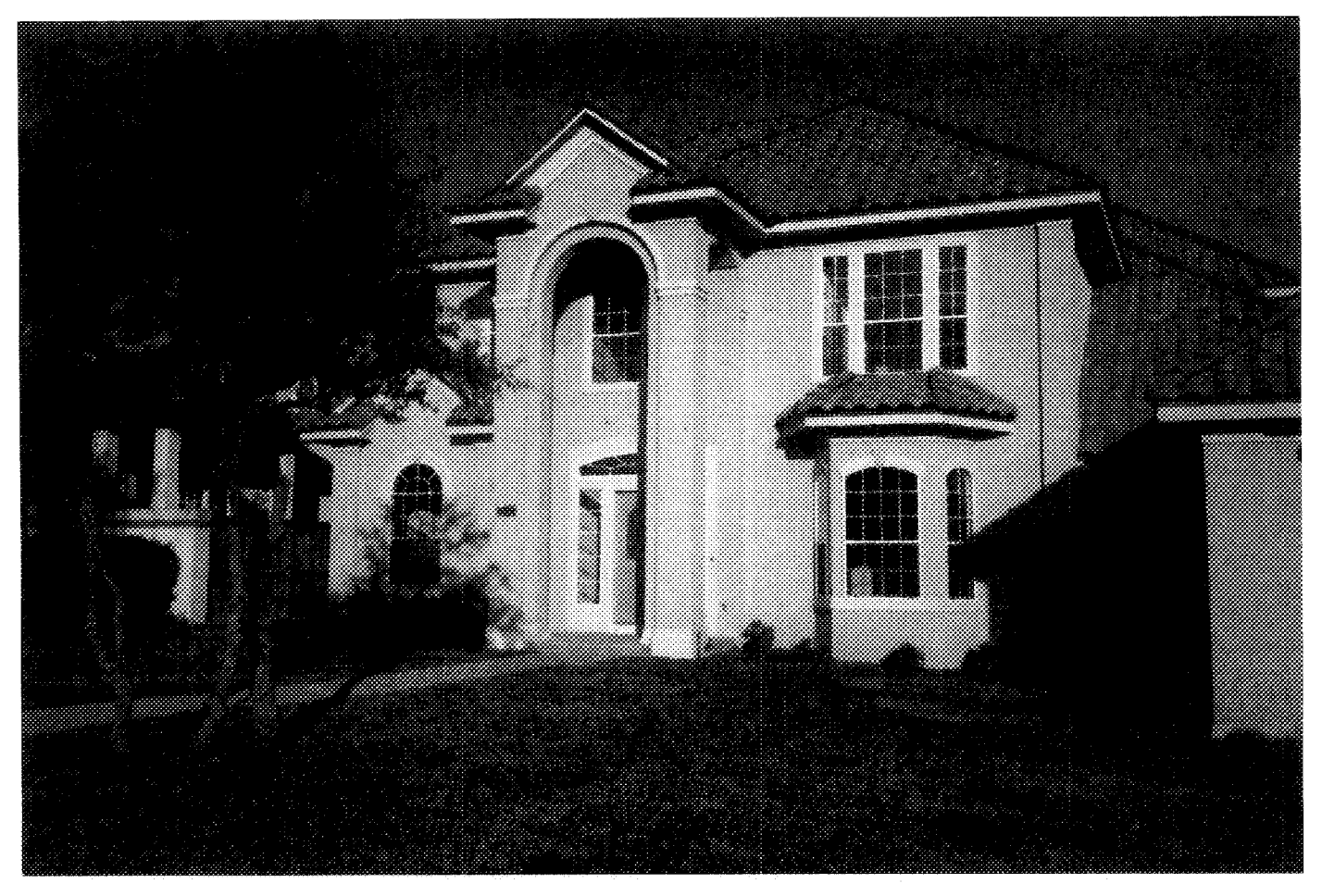
Figure 3. Scottsdale-style house.

communities, interviews with key informants such as the developers and real estate agents, and the collection of marketing, sales, and advertising documents. An unstructured interview guide was developed to elicit residents' decision-making processes concerning their move to the gated community. The research team<sup>7</sup> collected field notes and interviews in the New York area, while I worked alone in San Antonio. The interviews lasted between one to two hours, depending on whether the interviewer was taken on a tour of the house. We did not ask to be taken on a tour, but many times interviewees offered, and we used the tour to learn more about the person's tastes, interests, and preferences.